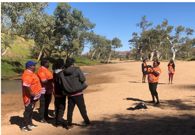
Members took the opportunity to snap a few photos of their own for family and friends back home.