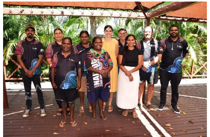
FC Members in Jabiru with Chief Minister and Cabinet Top End Regional staff.

The three day itinerary was packed with activities that challenged members while providing opportunities to experience the Kakadu region and what it had to offer culturally, visually and historically.