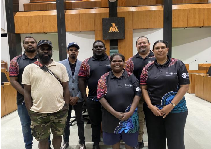
Aspiring politicians in the group, selected their seats in the chamber for when they are elected into Parliament!

To wrap up the first day members went on a guided tour of NT Parliament House. They learnt about the history of Parliament House and the roles and responsibilities of those who are elected to represent Territorians. Members found the tour informative and were especially interested in the visit to the Legislative Assembly Chamber. The tour was followed by a meet and greet with former NT Minister, Joel Bowden.